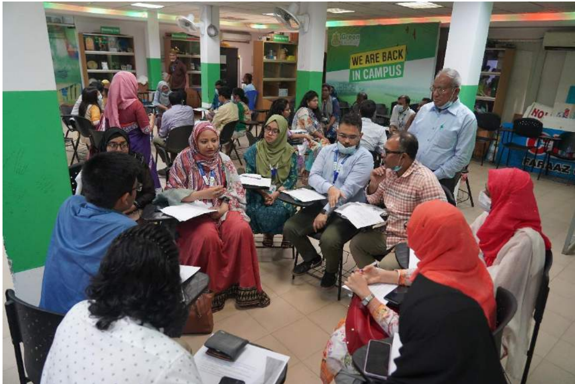
13. Workshop on 'Strengthening Leadership Skills for the Club Leaders' of GUB Clubs by CETL (11 th August 2022)